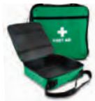
Lyon Bag (empty)